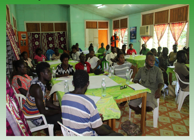
ISDT training in Gizo

Gizo PIU is currently having its batch 16 ISDT training for communities of District, Jah Mountain and Banana Valley. There are total 35 participants. Training begins yesterday and will conclude on Friday next week.