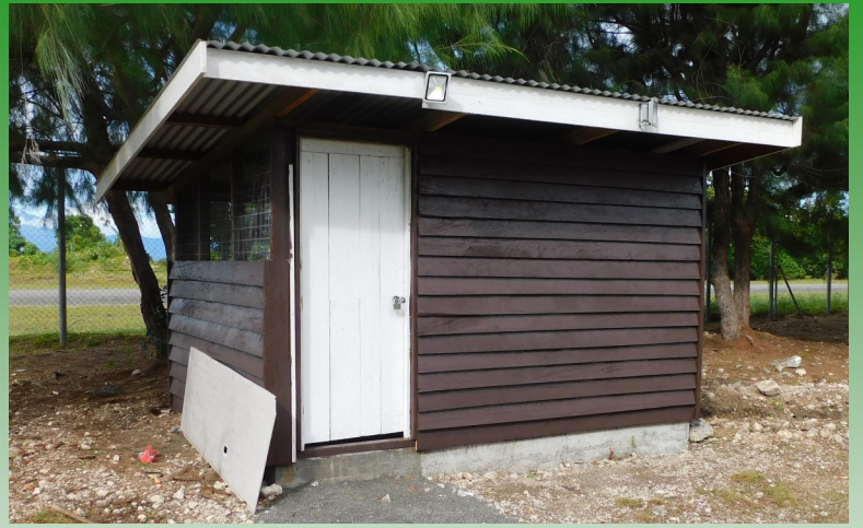
The generator house at Nusatupe quarantine centre in Gizo has been completed. The generator has already been installed successfully and tested yesterday.