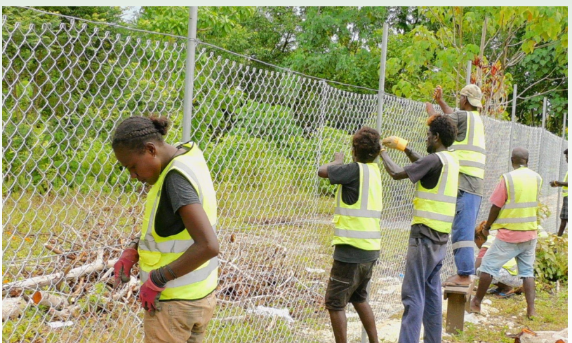
Fencing of Dunde school in Munda is near completion. Currently workers are continuing running the fence. By next week it should be completed.