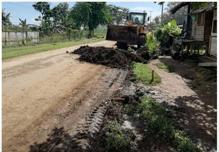
Zalekoro Company Limited has collaborated with CAUSE project on drainage clearing at black town in Noro. The joint partnership has seen a lot of improved clean area within the vicinity.