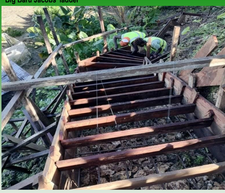
The form work of big Baru Jacob's ladder has finally landed on the last section of the ladder at the bottom of the hill. Next week there will be concrete pouring to be follow by railing.