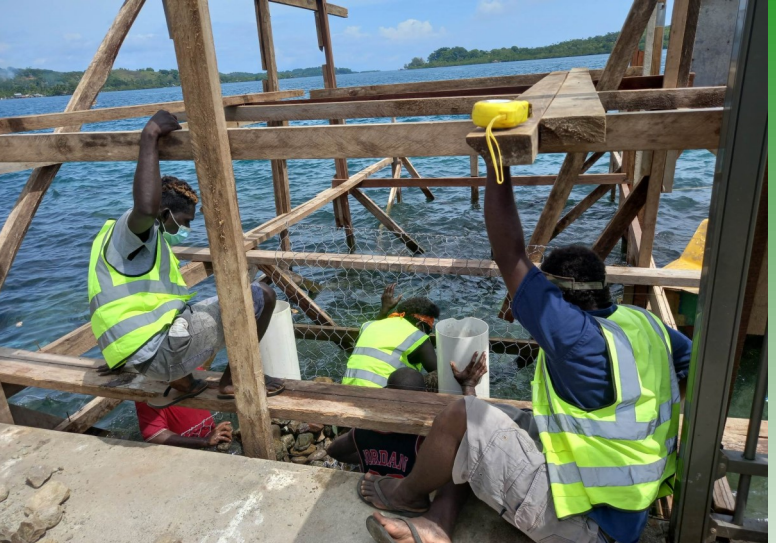
Work is going on at Gizo Jetty. Currently, one of workers are assembling stones into a Gabion basket ahead of concrete works.