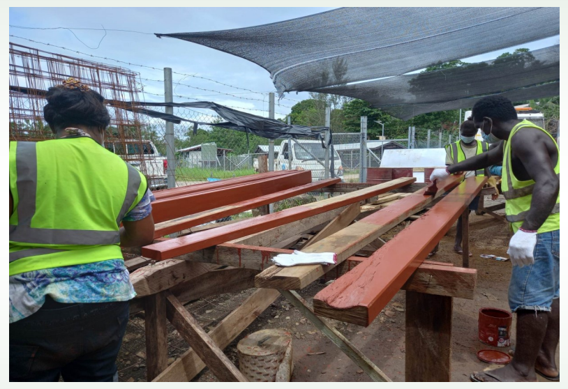
Workers in Gizo are currently preparing timbers for jetty decking that will be installed later on the two jetties currently under construction.