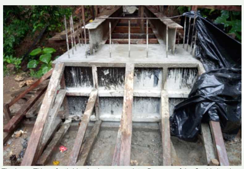
The lower Titinge footbridge is almost complete. Because of the Covid situation work has been halted but will recommence soon to complete the final work.