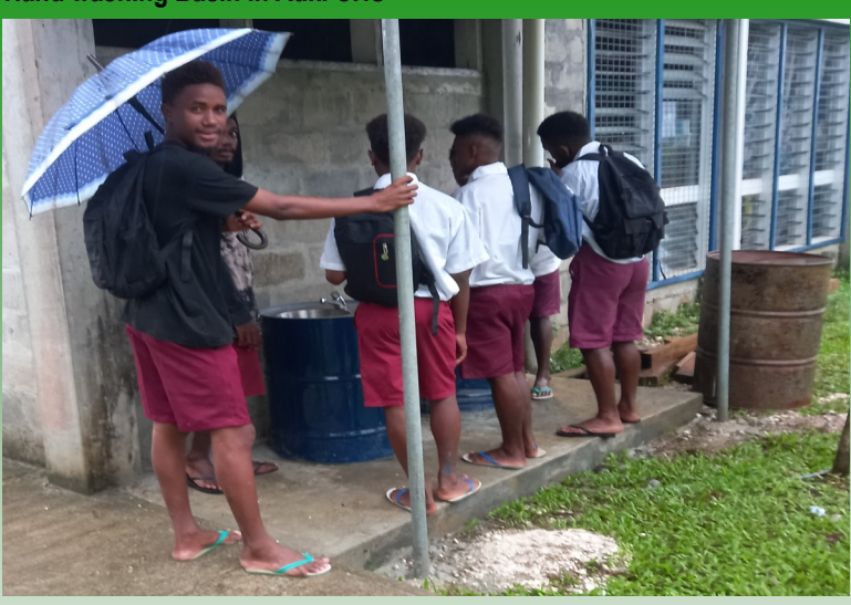
More hand basins were distributed in Auki. The latest are in Auki CHS, Townend school and St Augustine Kindy.