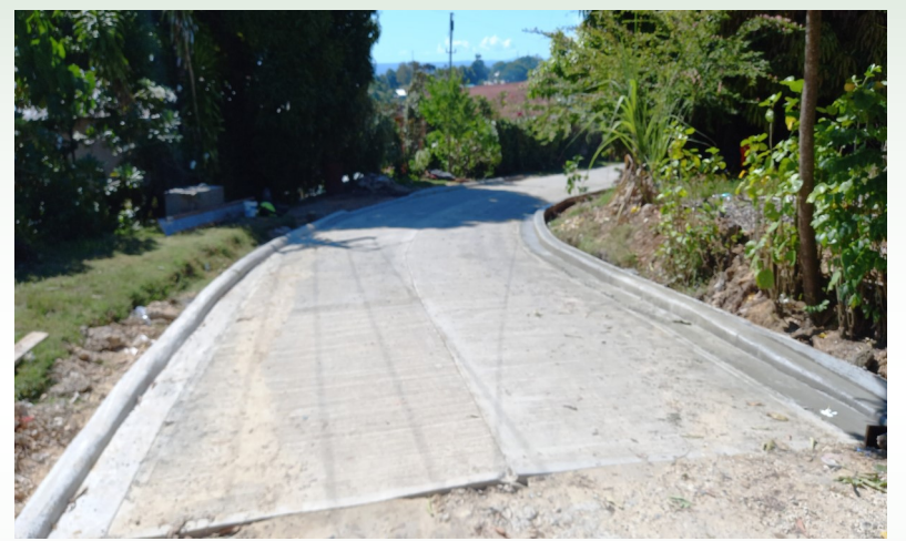
Work on the Chupuchao road and drainage system is going well at Skyline heights of Central Honiara.