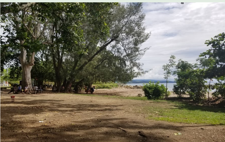
Work on the new public space improvement at the Rove Children's Park in Honiara will commence soon. The improvement will improve the recreation area for the children.