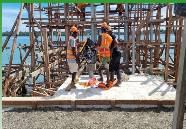
Noro CBD Jetty Update

Piling is currently ongoing on the Noro CBD jetty. Last week the workers completed the retaining wall and approach to the jetty. In the coming weeks they will be working on timber works.