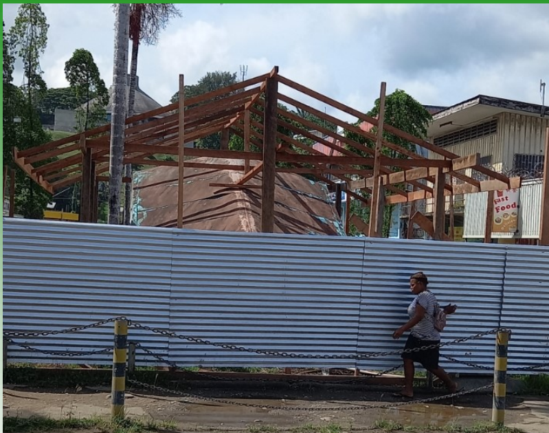
Work on the Point Cruz under pass is going on well. Already a temporary shelter is shaping up. Once roofing is install workers will dismantle the current under pass shelter and will work on new one.