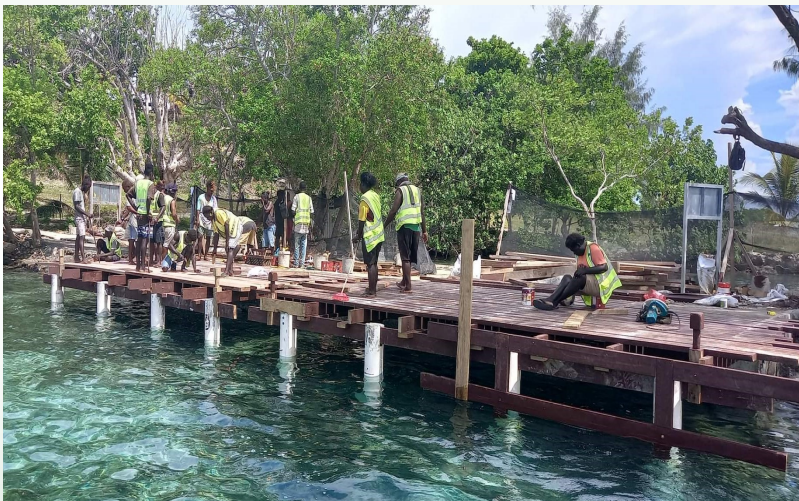
Decking on the new jetty at Nusatupe at Gizo has completed. Currently workers are working on railings and it should be fully complete in the coming weeks.