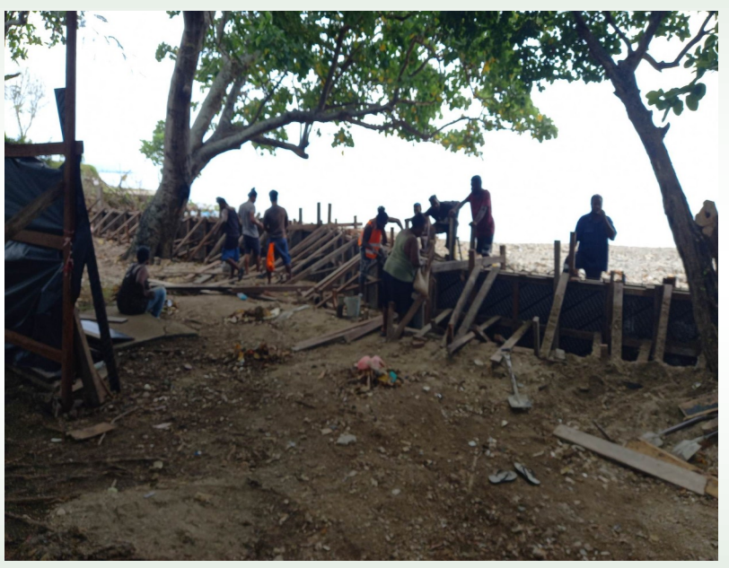
The concrete pouring at Childrens park wall has been completed. In the coming weeks workers will work on the next phase of the project