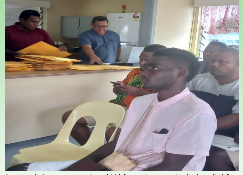
Last week there was opening of bid for contractors who had applied for road rehabilitation works in Honiara. Results of successful applicants will be made known in the coming weeks