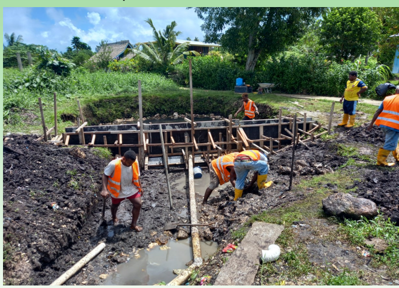
Work on the water source improvement at Kunu of Auki is progressing well. The water source will be fence as well.