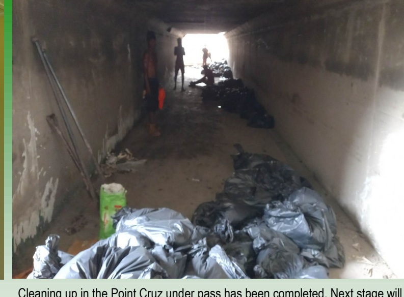
Cleaning up in the Point Cruz under pass has been completed. Next stage will be working on the improvement on the surface.

Work on the Noro clinic is in the finishing stage. Currently painting is going on to be follow by cleaning up.