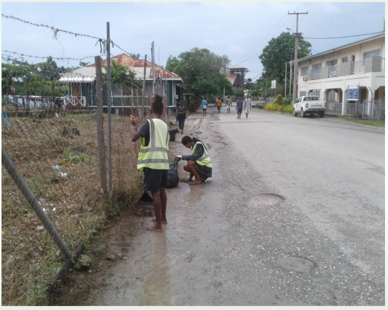
Street cleaning in Gizo town is ongoing. Every week there is a group of allocated to clean up the town.