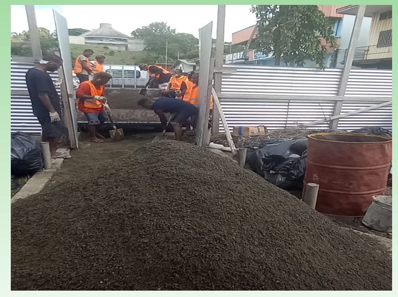
Workers unloading gravels ahead of next weeks brick works

Work on the Point Cruz under pass has started after quite sometime cleaning up from the inside. Currently workers are working on the surface of the entrance. Next week painting will commence.