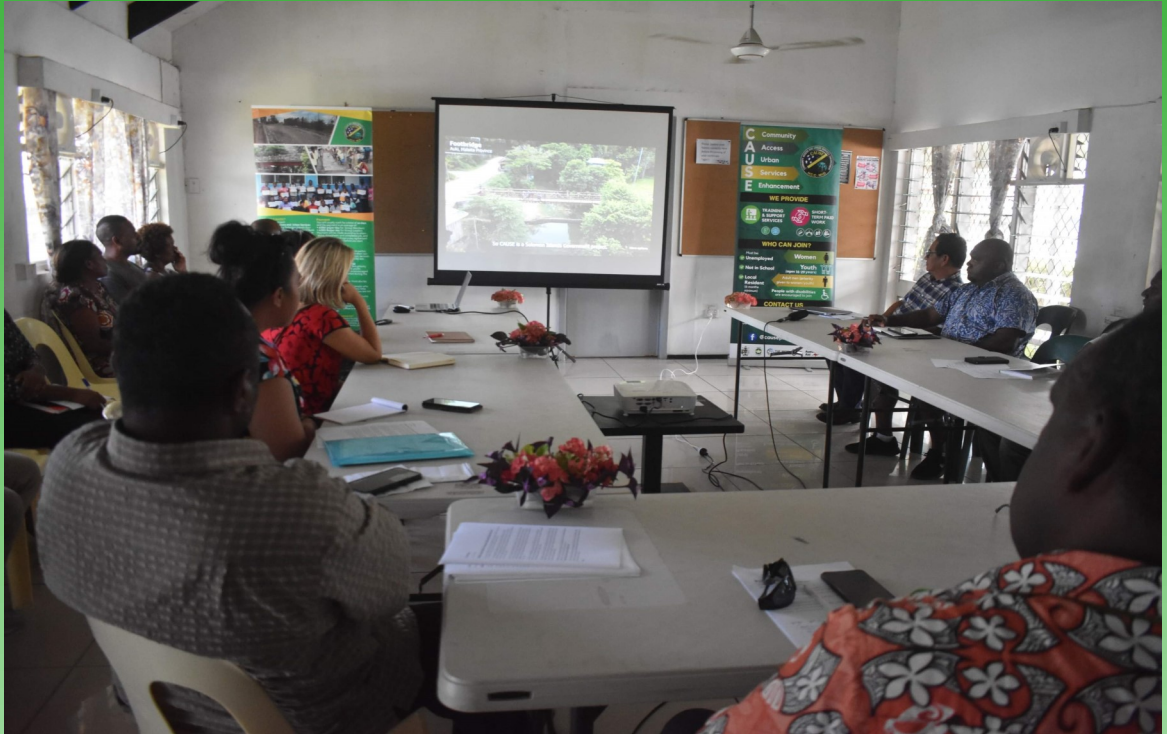
CAUSE this week launched its 10-minute video on Covid-19 response and economic recovery. The launching was attended government representatives and media.